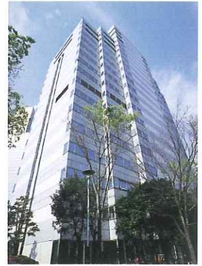
IUK Head Office